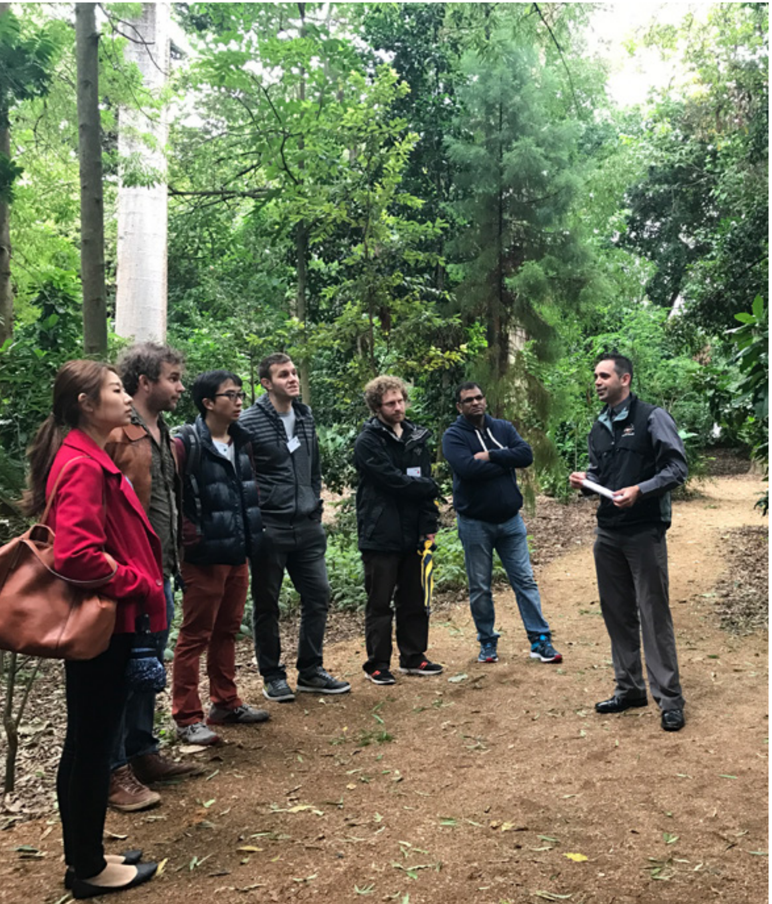
Registrars attending one of the GPEX Aboriginal and Torres Strait Islander cultural education workshops at the Adelaide Botanic Gardens.