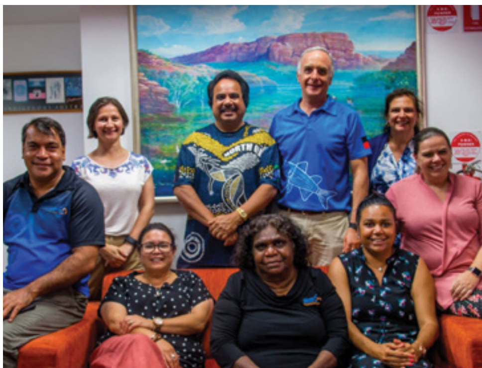
GPEX staff visited the office of NTGPE in the Northern Territory, November 2017.

The Aboriginal Health Team made visits to Aboriginal health training posts throughout SA including Port Lincoln Aboriginal Health Service, Nunkuwarrin Yunti, Umoona Tjutagku Health Service, Watto Purrinna and Pangula Mannamurna Aboriginal Corporation. The GPEX Aboriginal Health Team visited Northern Territory General Practice Education (NTGPE) to understand how they deliver cultural education to registrars in the Northern Territory. Their knowledge sharing visit led GPEX to embed and formalise various activities across the organisation including focussing on the service provided by GPEX's Cultural Mentors and Culutral Educators.