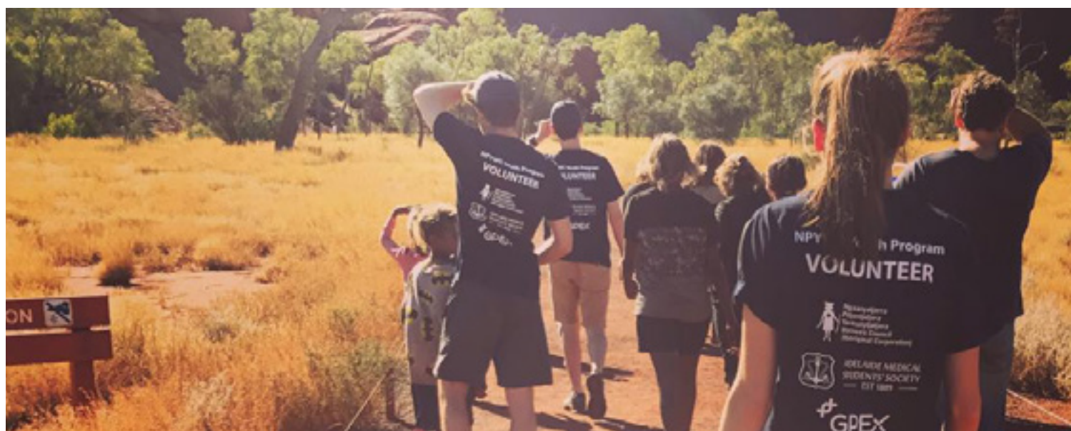
Adelaide Medical Students' Society (AMSS) APY Exchange Program.

"From AGPT to community practice - this is the training/workforce pipeline."